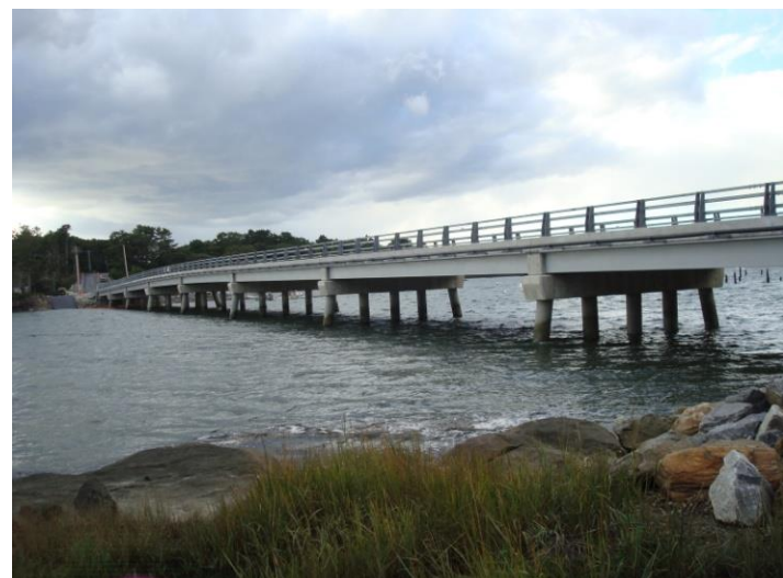
Completed Knickerbocker Bridge