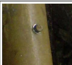
Pumping port on FX 70® pile jacket

How it works: A pile is repaired through reinforcement with a permanent outer fiberglass jacket, custom manufactured from inert, corrosion-free materials. Each jacket is positioned on a pile, its vertical seam secured by FX 763 Trowel Grade Epoxy and SS Screws, and then a bottom seal is installed of FX 70-6 MP Marine Epoxy . After setting (minimum 12 hours) the annulus is filled with FX 225 Cementitious Non-Shrink Non-Metallic Underwater Grout . This grout is pumped through strategically-placed pumping ports pre-positioned on the jacket.